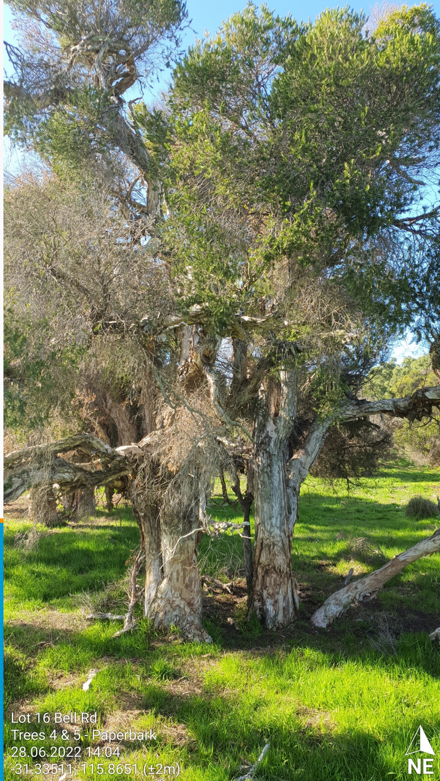
Lot 16 Bell Rd Trees 4 & 5 - Paperbark 28.06.2022 14:04 -31.33511; 115.8651 (±2m)